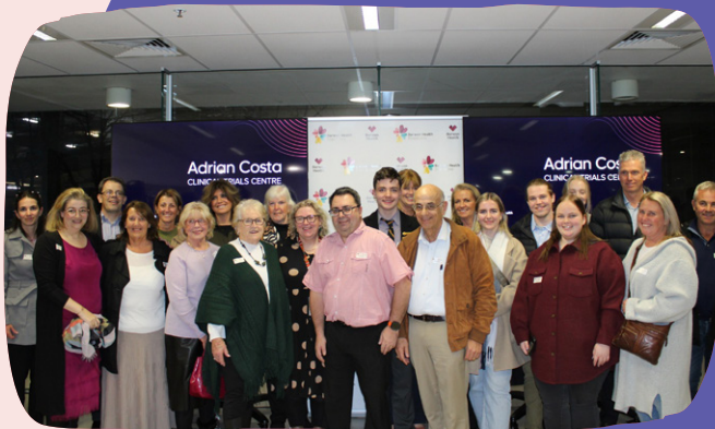
Pictured: Three generation of Geelong's Costa family came together to tour the Adrian Costa Clinical Trials Centre.