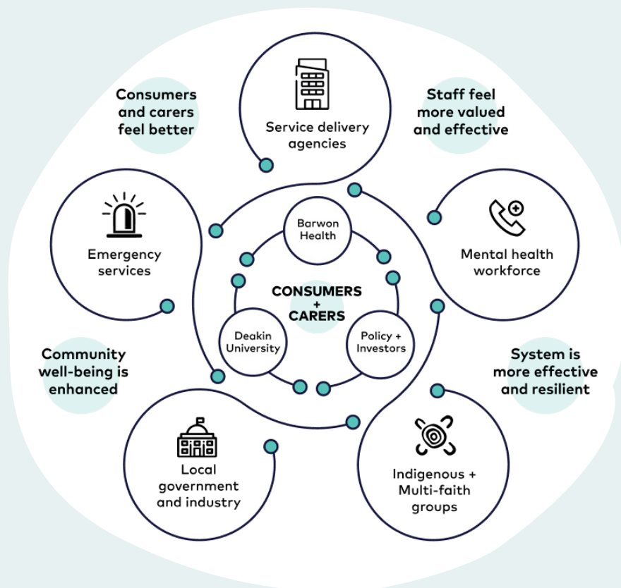
Pictured: Creating a regional Listening and Learning Mental Healthcare System, CHIME will partner with key stakeholders in the region.