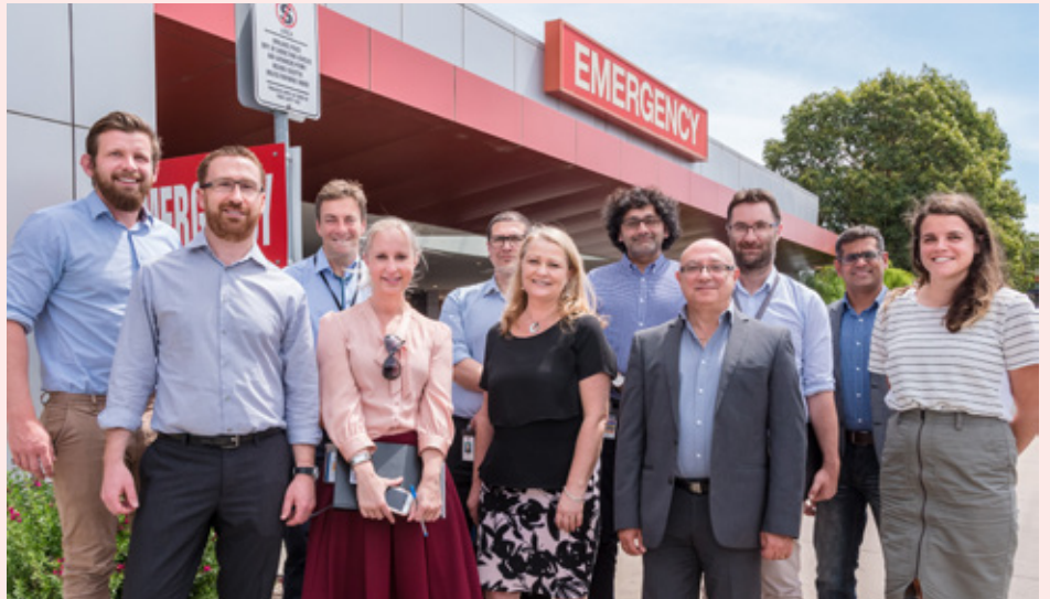
The EDIS Project team has been working behind the scenes to prepare the Emergency Department staff for the new FirstNet software rolling out next year.

The EDIS Project is a clinical transformation project implementing a new information system into the University Hospital Geelong Emergency Department (ED).