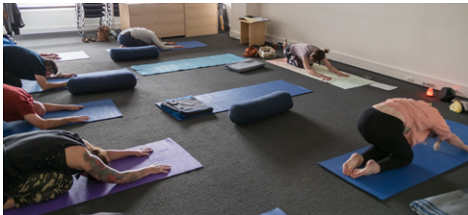
Barwon Health is working with Deakin University and the Western Victoria Primary Health Network to measure the link between yoga and mental health.

"We are thrilled that this work is being led right here in Geelong."