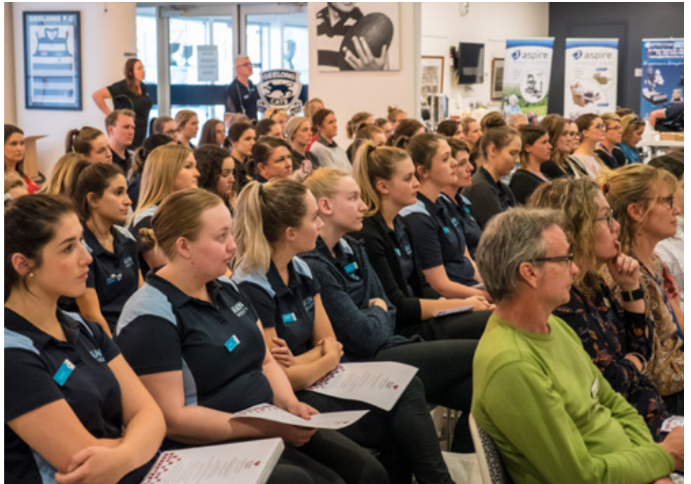
Students and occupational therapists attended an annual forum during Occupational Therapy Week.