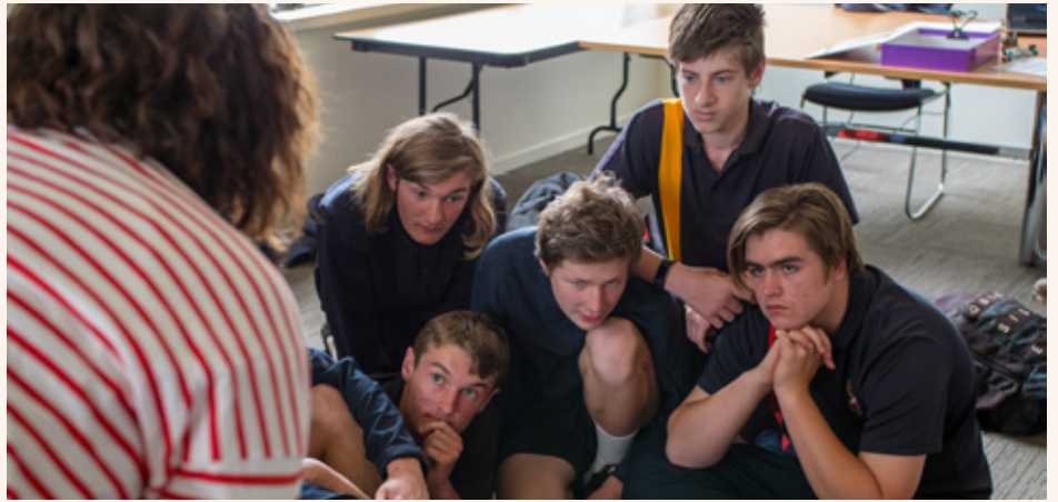
Students engaged in interactive workshops that explored respectful behavior and healthy relationships in a variety of scenarios.