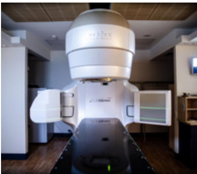
The new Linear Accelerator will speed up treatment time for patients at Barwon Health's Andrew Love Cancer Centre.

"This offers another energy to treat with, giving staff more options when planning a patient's radiotherapy treatment."