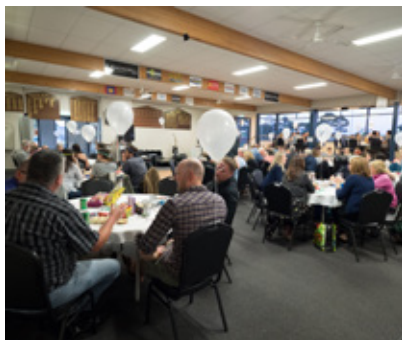
The community joined together in the name of mental health research, awareness, and a love for trivia.

More than 120 trivia fans joined together to shine a light on mental health and raise almost $3000 for bipolar disorder research during Mental Health Week.