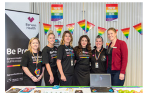
Staff at University Hospital Geelong showed their support for National Coming Out Day.

Barwon Health is committed to providing safe and inclusive health care for the GLBTIQ+ community and we encourage you to join us on our journey towards Rainbow Tick Accreditation.