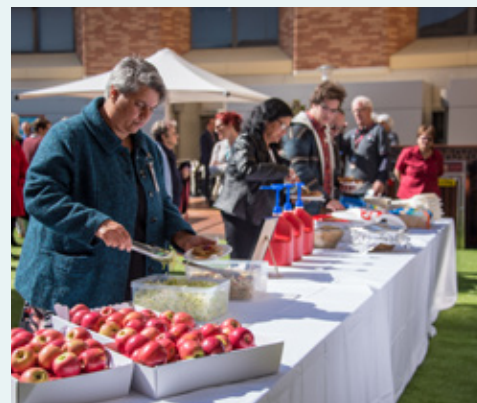
Staff were invited to a free barbecue to celebrate the opening of the refurbished University Hospital Geelong podium.

“Our staff are now enjoying a more appealing outdoor seating area for staff, patients and visitors to take a break or share a meal.”