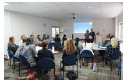
Barwon Health staff from multiple disciplines learn about harnessing influence in the health care system.

The AdvICE core courses and study days will be available again in 2019 and can be applied for via GROW.