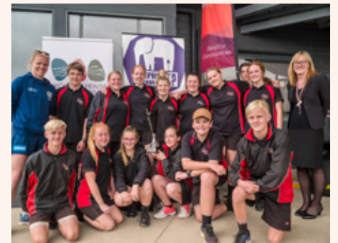
North Geelong Secondary College won the Barwon Respect Netball Cup.